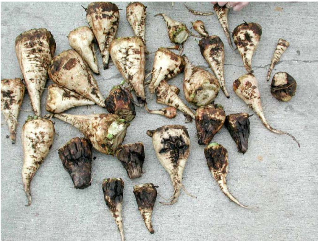
Figure 4. Sugarbeets with different levels of Aphanomyces infection.