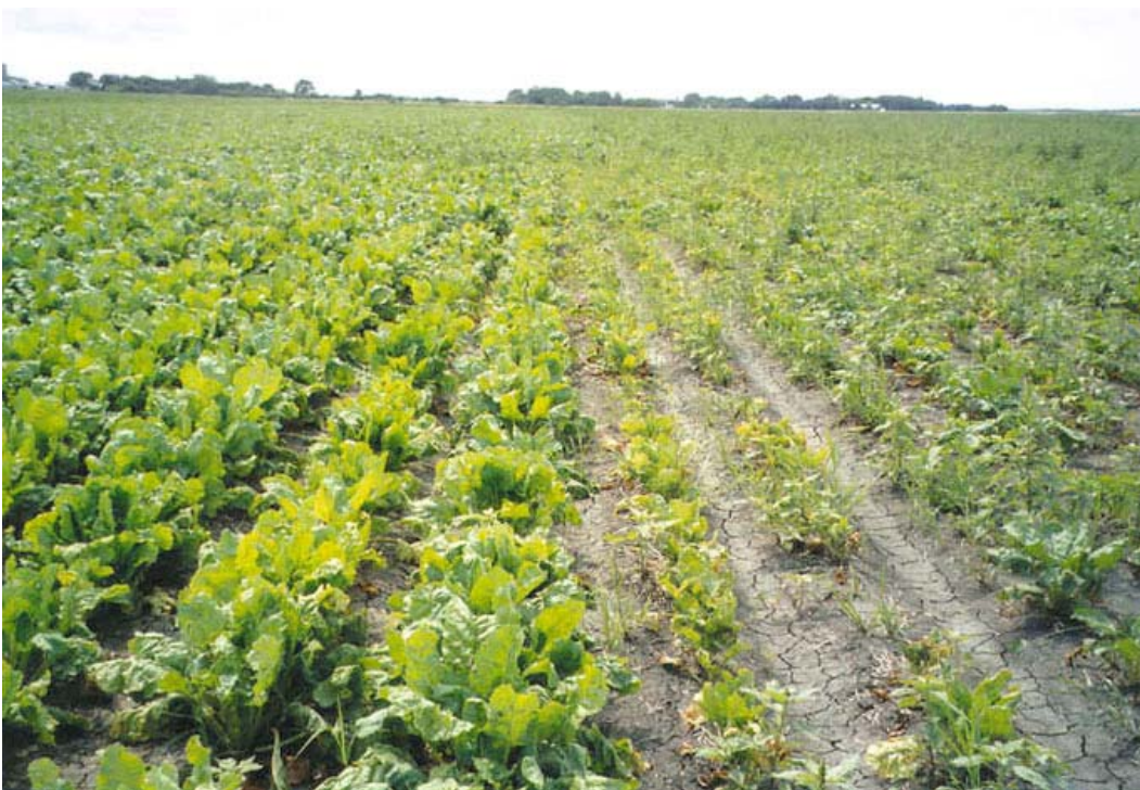
Figure 7. Aphanomyces infected area of field. Spent lime applied on the left. No spent lime applied in the center right. Spent lime application difference from the Sand Syndrome Study.