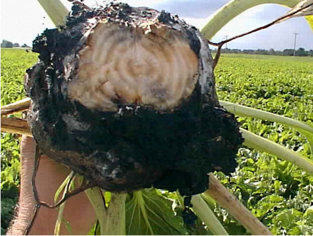
Figure 14. Internal discoloration of a severely infected Sugarbeet from Aphanomyces .