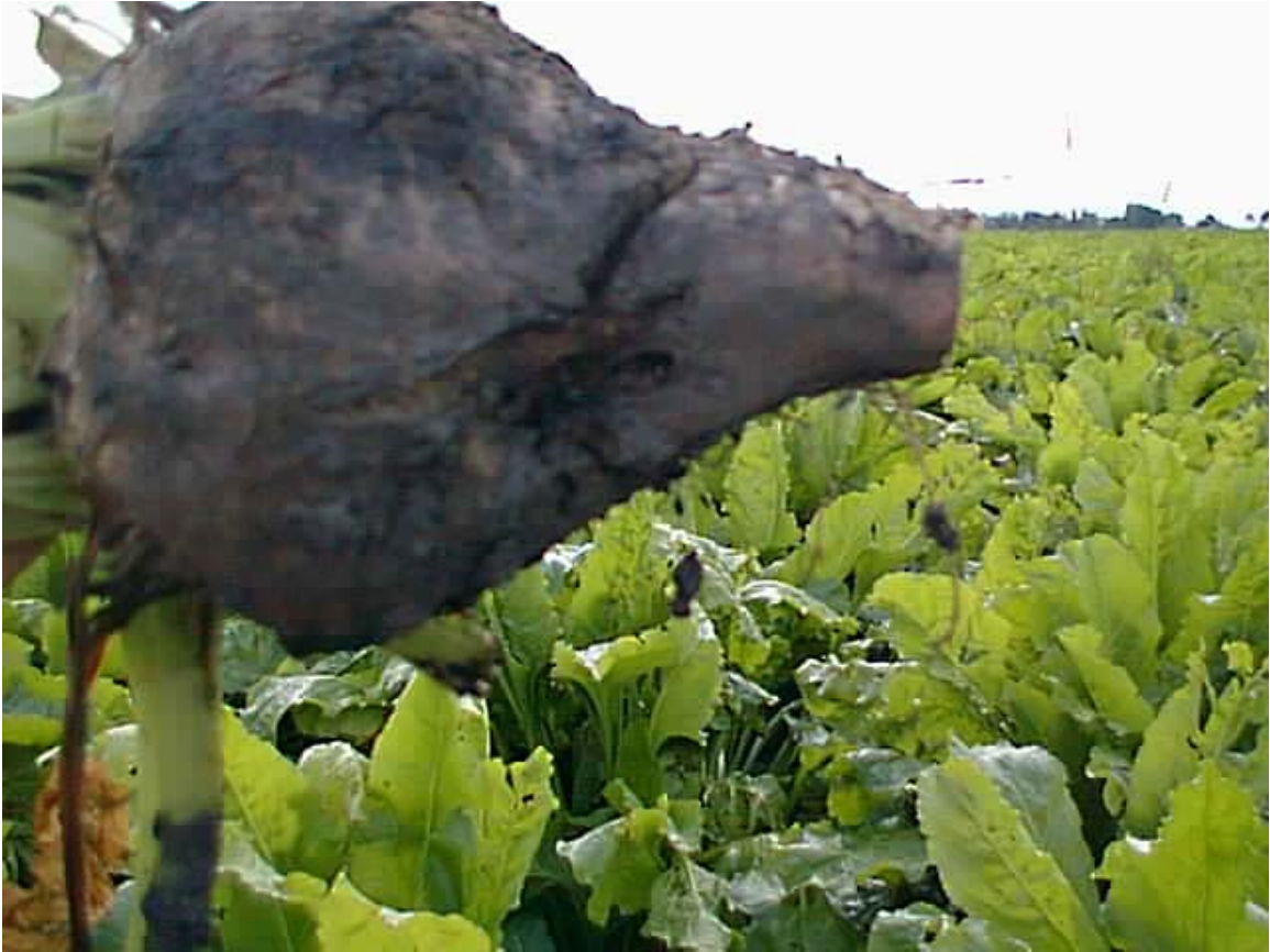
Figure 18. Surface rot and external cracking from Aphanomyces .