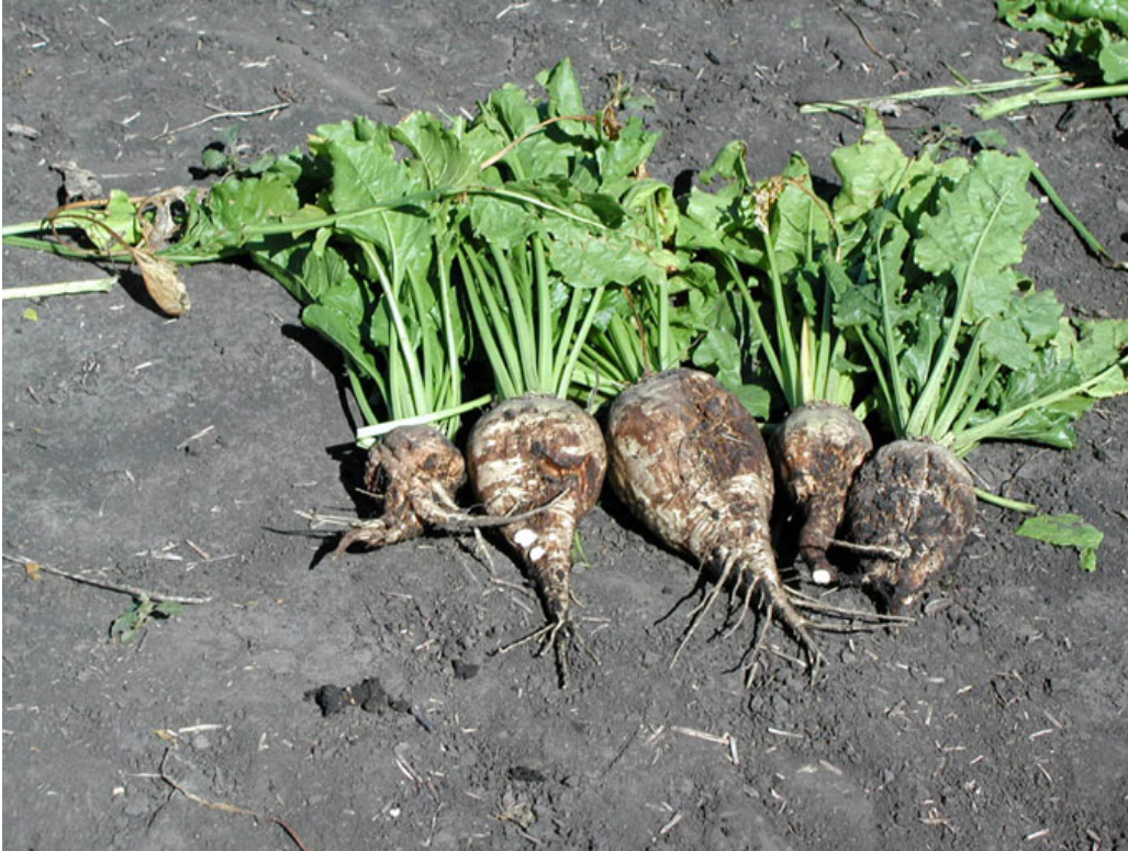
Figure 3. Scarring and surface cracking due to Aphanomyces .