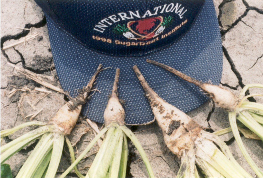
Figure 1. Tip rots due to Aphanomyces .