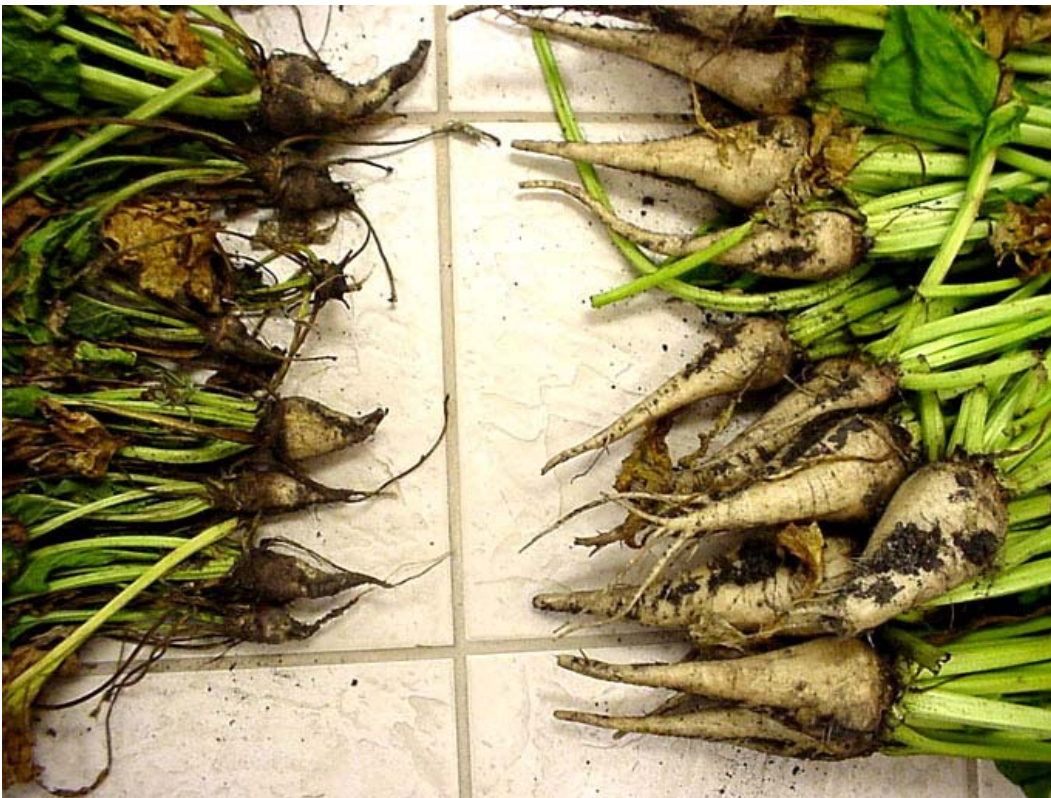
Figure 8. Comparison of Aphanomyces infected Sugarbeet (left, no spent lime) and healthy Sugarbeet (right, spent lime applied). Spent lime application difference from the Sand Syndrome Study.