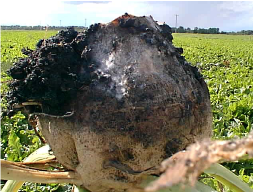
Figure 13. Rotted Sugarbeet with mold on the side and no tip caused by Aphanomyces .