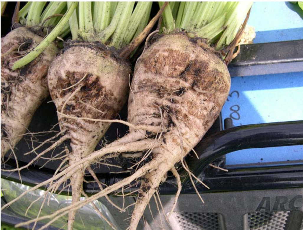
Figure 6. Surface scarring and sprangling due to Aphanomyces.