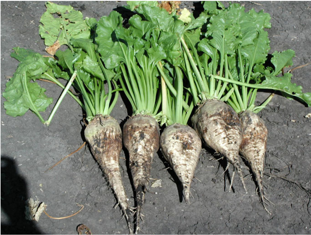
Figure 2. Scarring due to Aphanomyces .