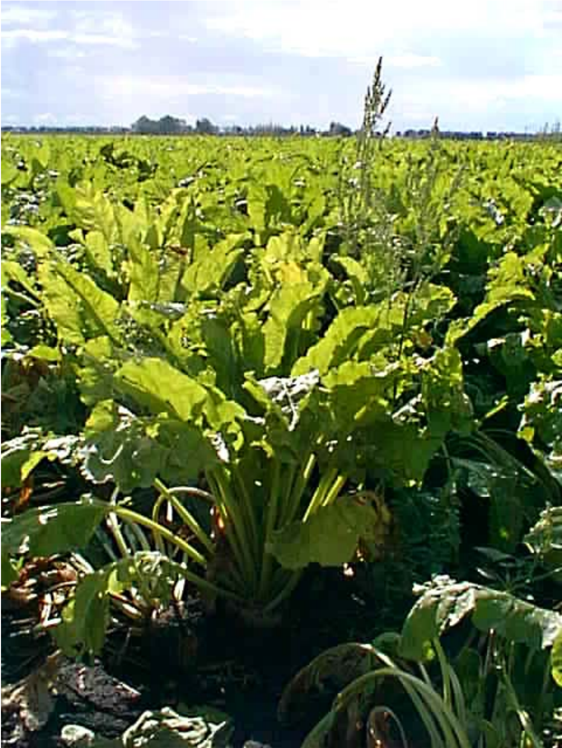
Figure 17. Aphanomyces infection in a field.