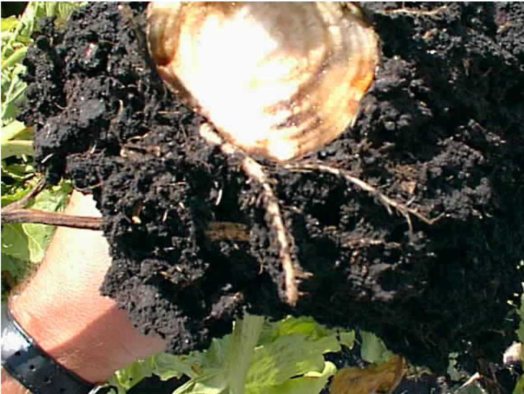
Figure 16. Internal discoloration from Aphanomyces .