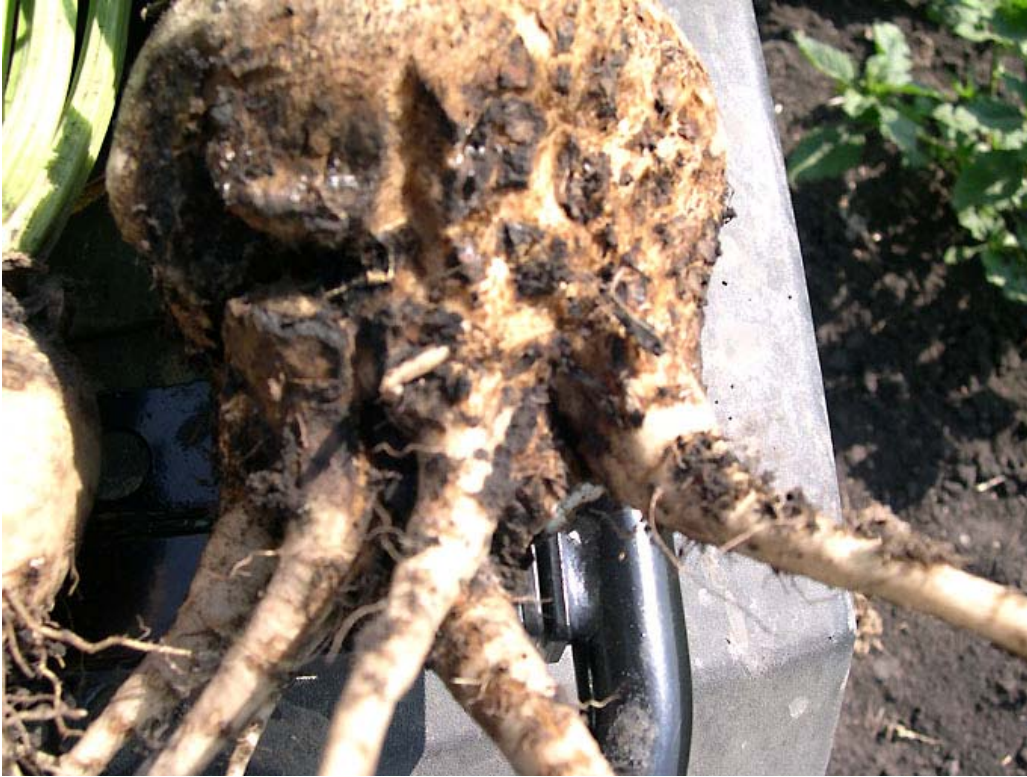
Figure 5. Surface cracking, scarring and sprangling due to Aphanomyces.