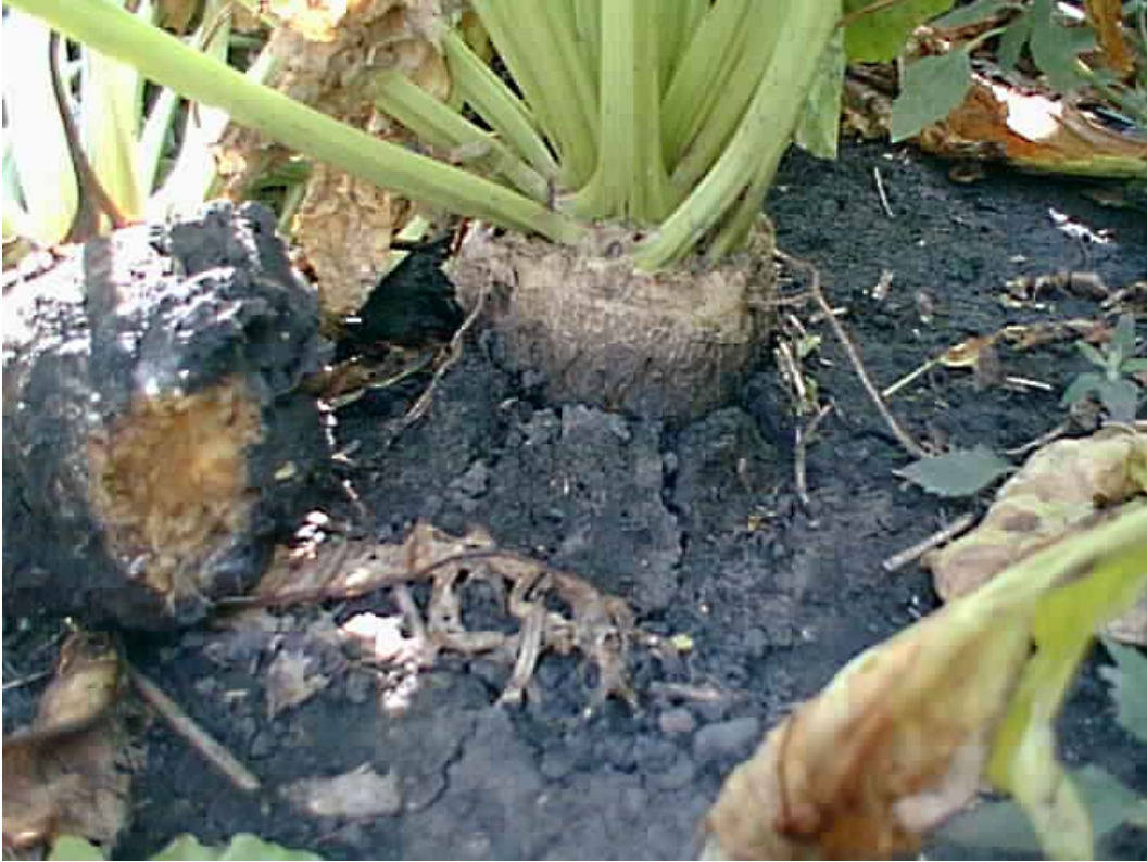
Figure 15. Severe Aphanomyces infection in a field.