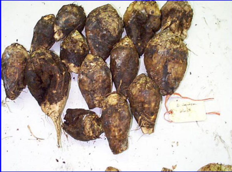
Figure 11. Sugarbeets with severe infection of Aphanomyces.