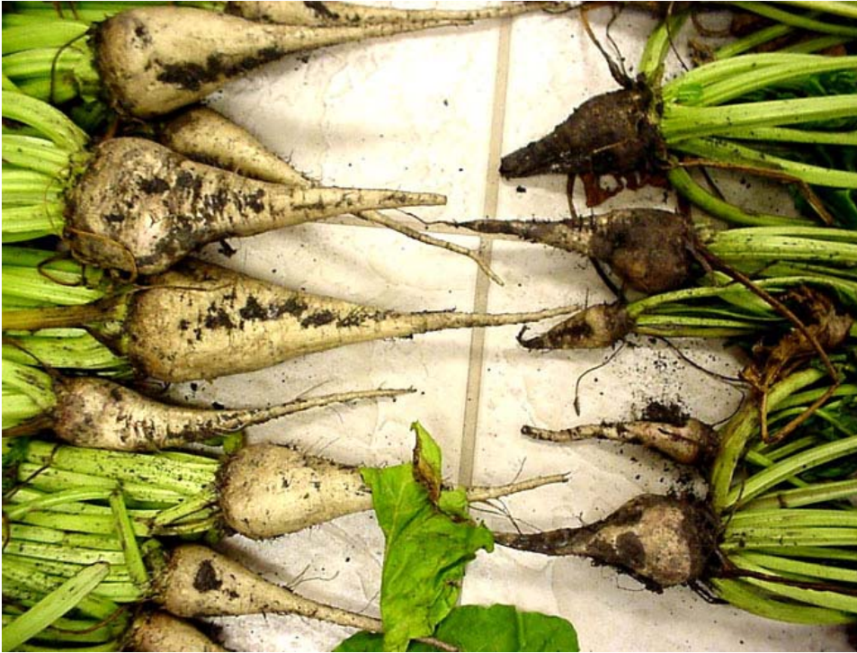
Figure 9. Comparison of healthy Sugarbeets (left, spent lime applied) and Aphanomyces infected sugarbeets (right, no spent lime applied). Spent lime application difference from the Sand Syndrome study.