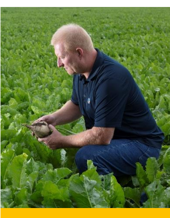
It is always a good idea to consult your Agriculturist with any questions