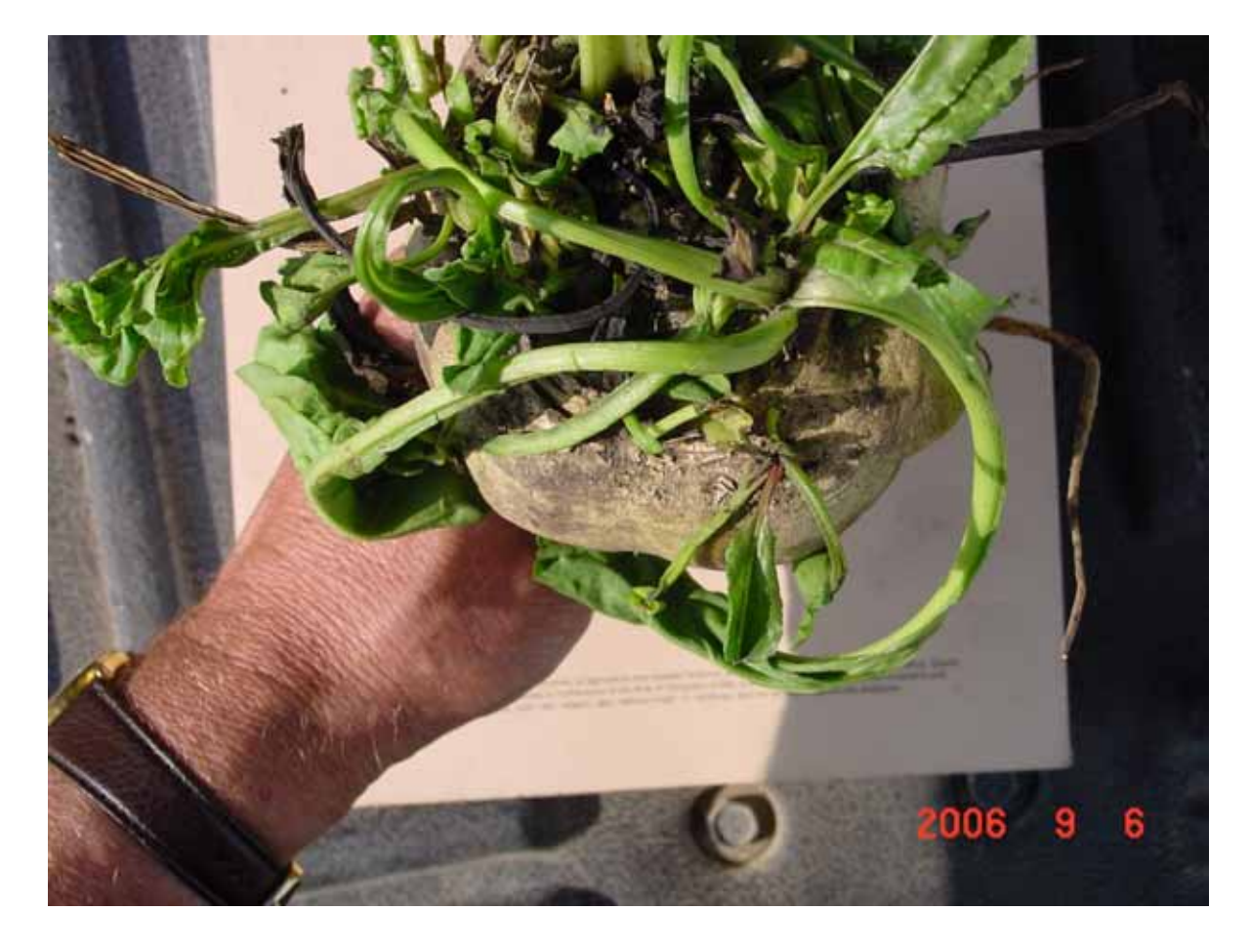
Boron deficiency pronounced in new leaves.