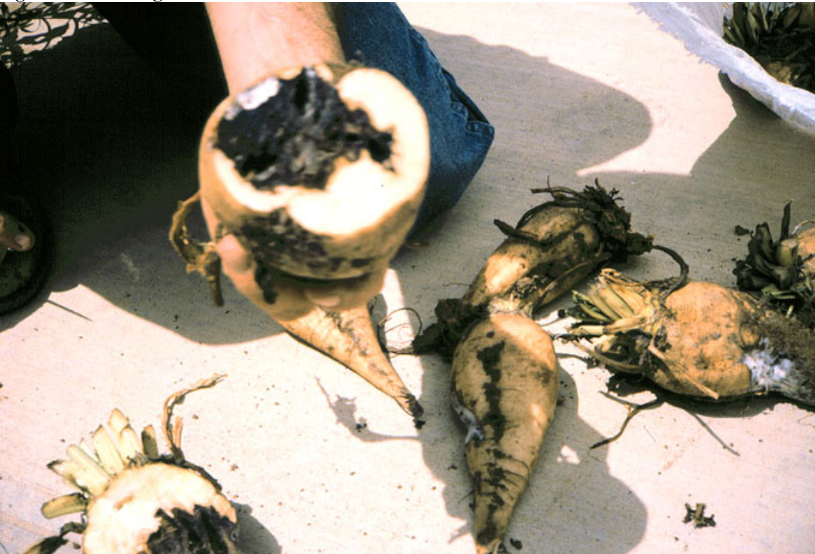
Figure 2. Internal rot from Rhizoctonia.

Figure 1. Yellowing from Rhizoctonia area in field.