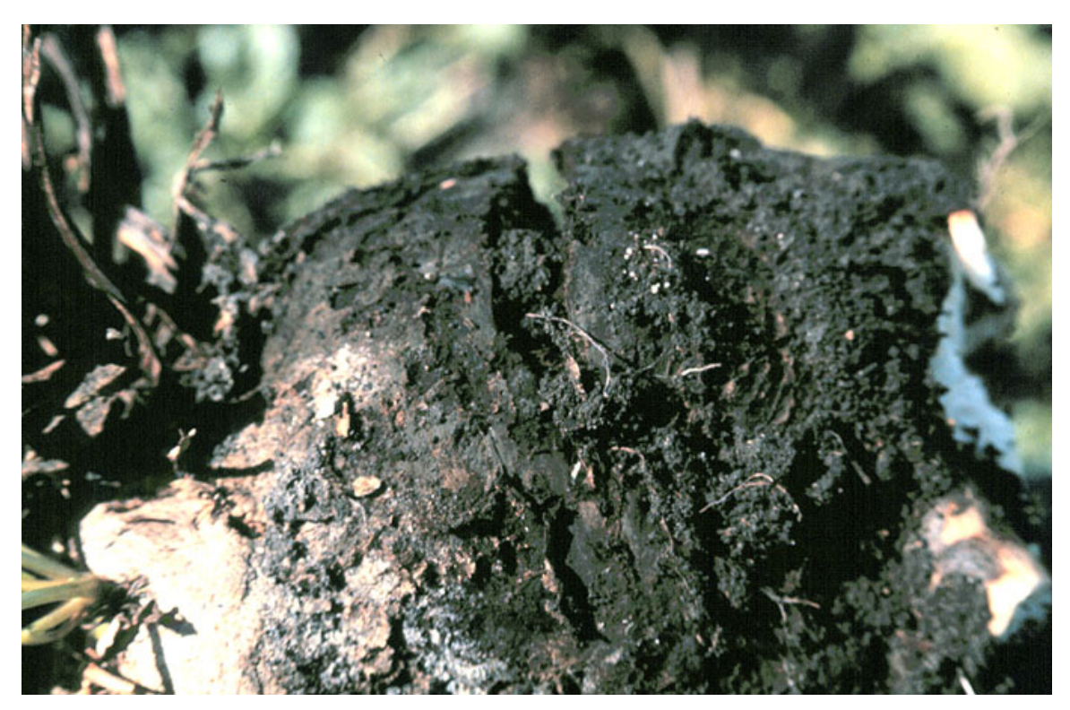
Figure 7. Surface rot and cracking on Rhizoctonia infected sugarbeet.