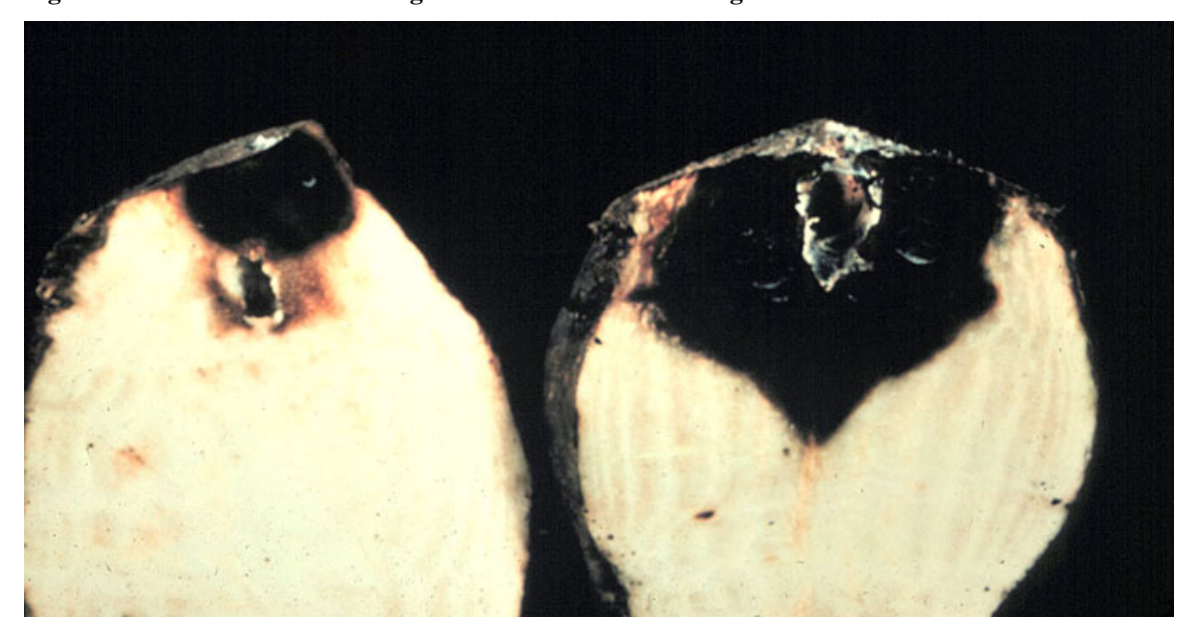
Figure 8. Internal rot growing in from an external lesion on a Rhizoctonia infected sugarbeet.