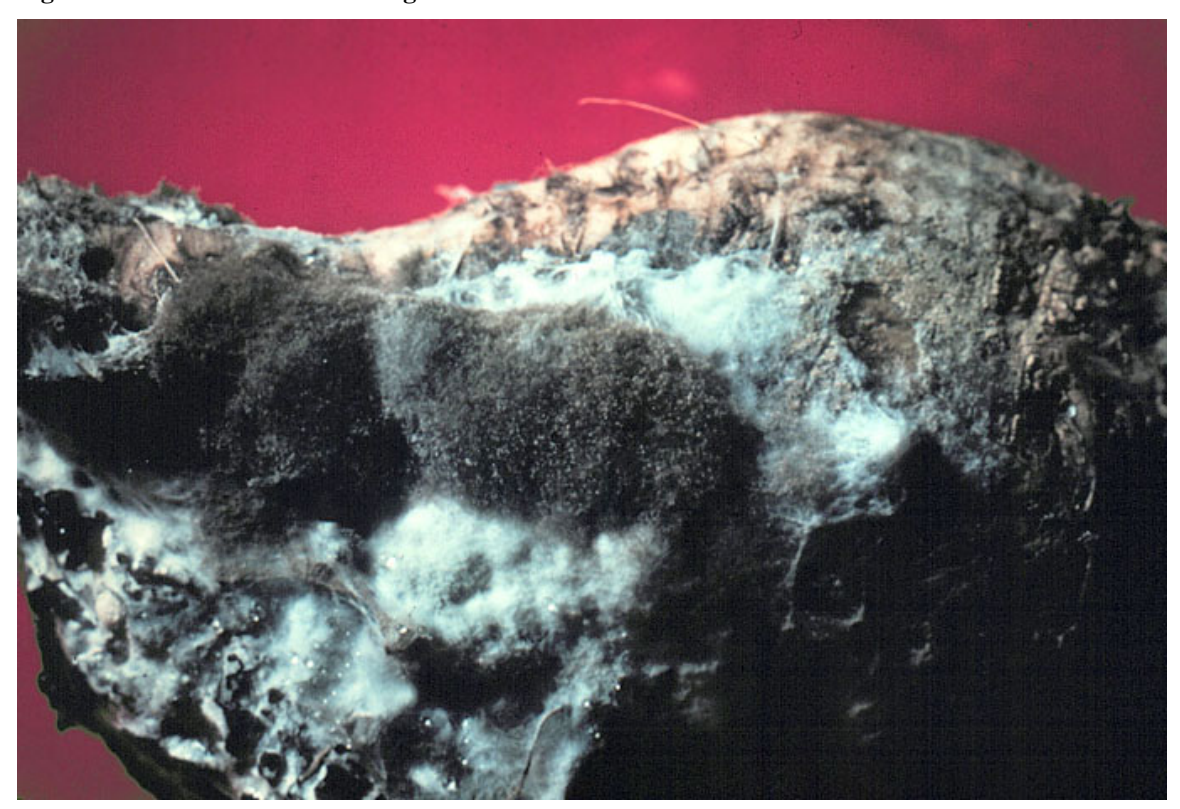
Figure 6. Mycelium growing on surface of Rhizoctonia infected sugarbeet.