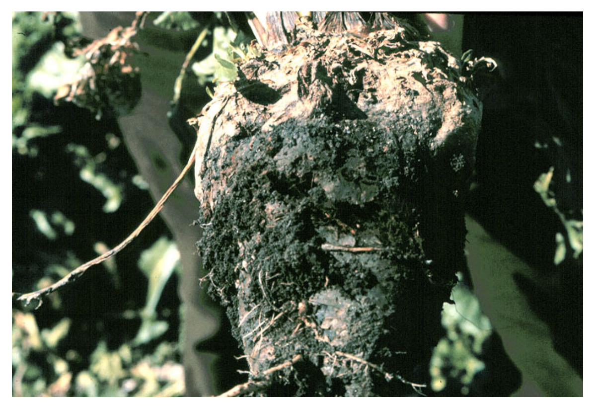
Figure 3. External rot from Rhizoctonia.