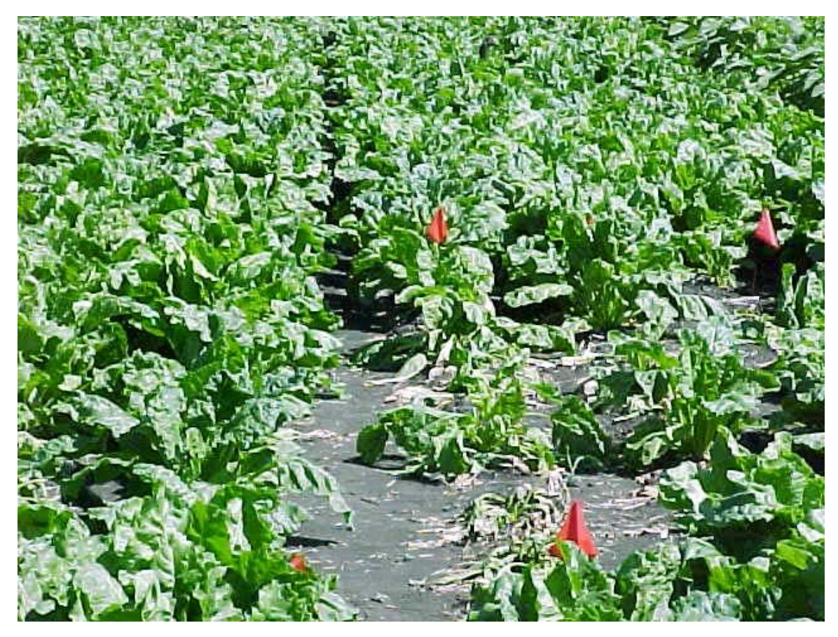
Figure \ 9. \ Rhizoctonia \ infected \ beets \ dying \ in \ a \ field. \ Note \ pattern \ of \ infection, \ down \ the \ row \ and \ into \ next \ row. \ Circular \ pattern.