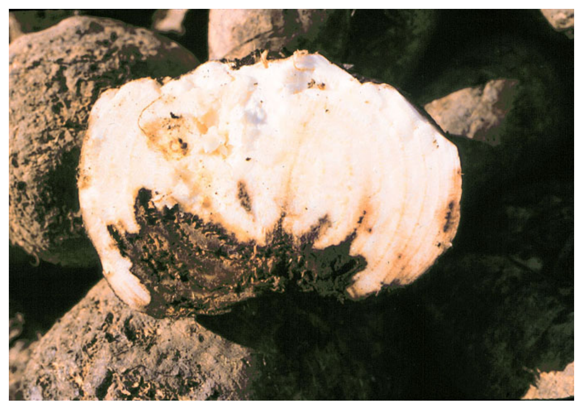
Figure 5. Internal rot and coloring of Rhizoctonia.